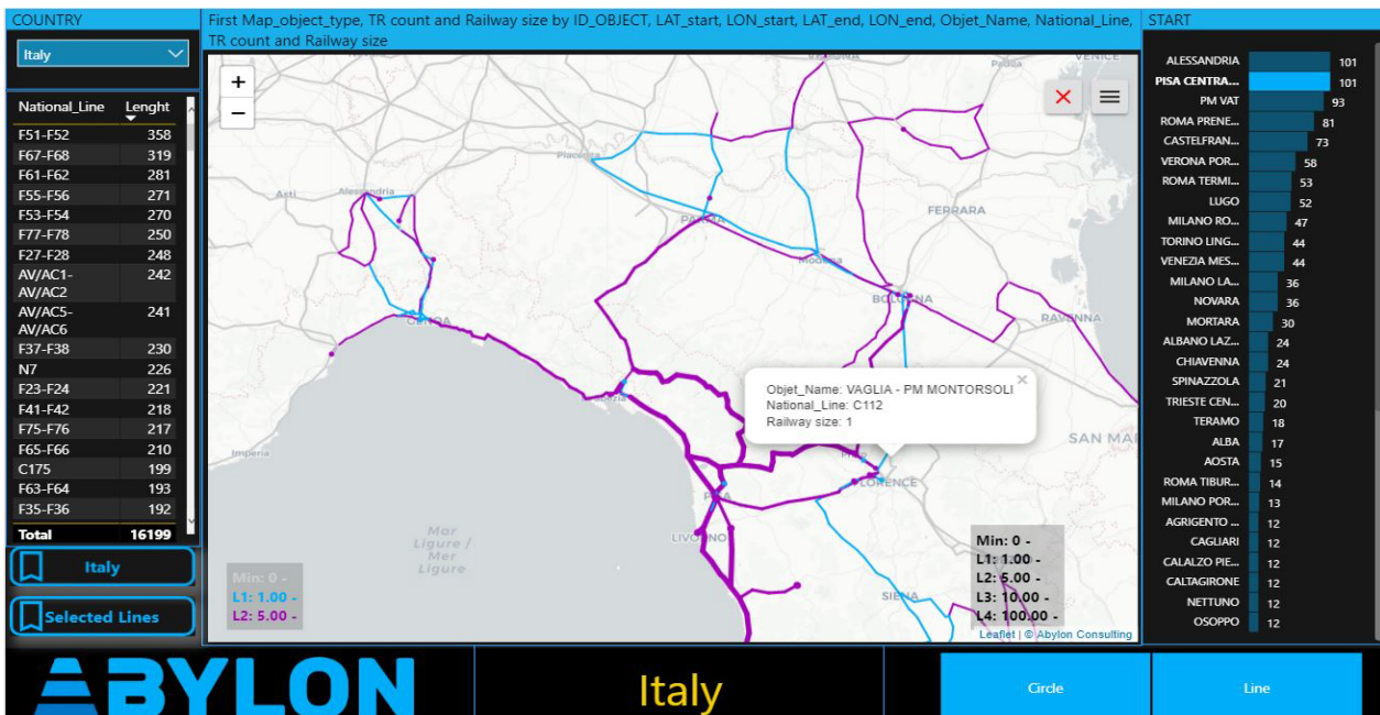
Custom railway map of Italy in Power BI

Using its flexible customization options, Abylon MAP can be used to visualize business critical data for various business cases within a number of sectors, including transportation, energy, utility, telco or any industry that uses complex, line-based infrastructures.